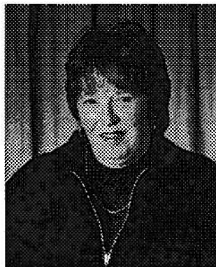
production of "State Fair" in Mississauga. She is also